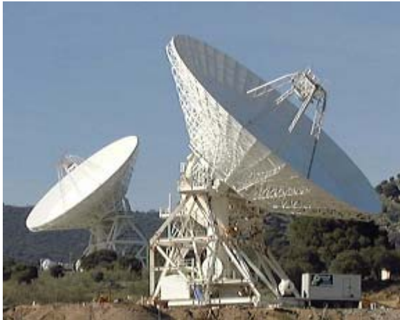
One of DSN's three deep-space communications facilities located approximately 120 degrees apart around the world

NASA's Deep-Space Network (DSN) consists of an international network of ultrasensitive receiving systems and large parabolic dish antennas that enable and support interplanetary space missions and radio and radar astronomy observations of the solar system and universe. The DSN also supports selected Earth-orbiting space missions. To accomplish this, the DSN operates three deep-space communications facilities located approximately 120 degrees apart around the world—in California's Mojave Desert; near Madrid, Spain; and near Canberra, Australia. These installations enable 24/7 monitoring of satellites, space probes, and spacecrafts (even as the Earth rotates) and make the DSN scientific telecommunications system the largest in the world.