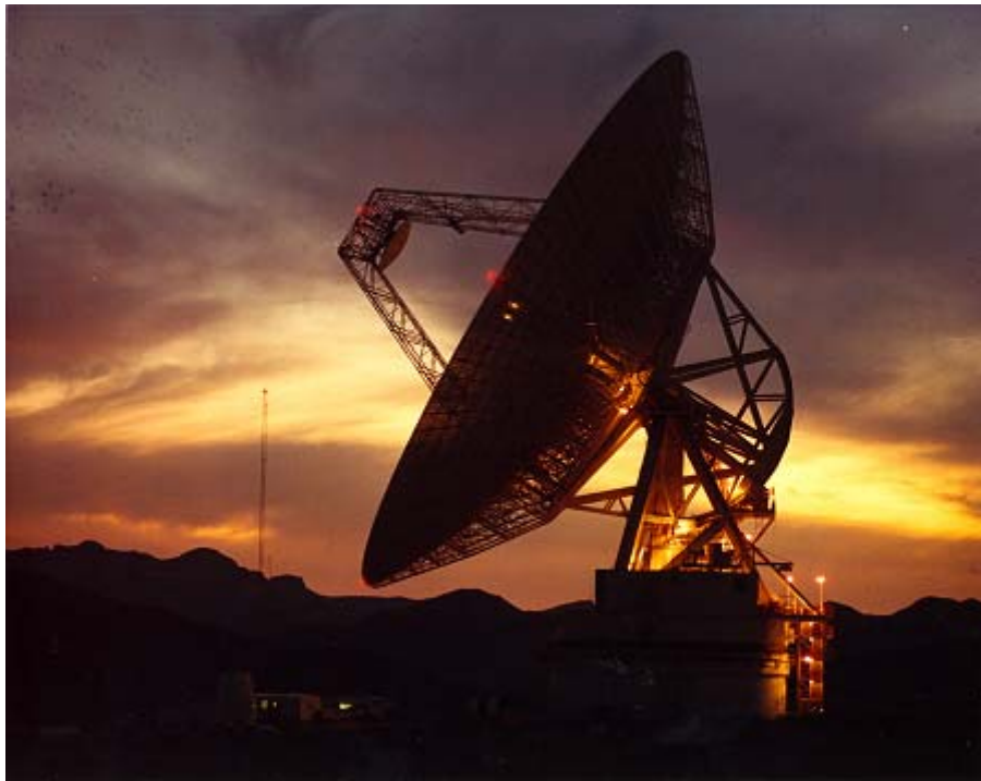
In Madrid, an antenna similar to this one will be equipped with load cell transducers and a SNAP PAC system to solve why cracks have developed in the large elevation bearing system

Last summer, at the DSN site in Madrid, during a time when a 230-foot antenna was already out of service for scheduled maintenance and upgrades, engineers detected cracks in the antenna's large elevation bearing system. These bearings support the 4 million lb weight of the antenna as it rotates and tilts up and down. The cracks were detected in two pairs of elevation bearings in June 2006 and the antenna's return to service was extended from four to seven months so repairs could be made.