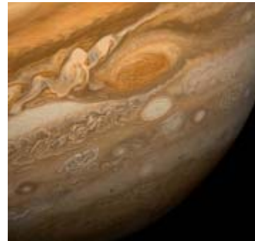
This photo of Jupiter's big red spot was taken by Voyager 1 and sent to earth via NASA's Deep Space Network

Among the many missions the DSN is currently tracking is the famed Voyager 1 and Voyager 2 space probes, launched in 1977 and currently more than 9 billion miles from earth headed for the outer reaches of our solar system. The Jet Propulsion Laboratory, founded in 1944 and managed by the California Institute of Technology, manages the DSN antennas for NASA, which uses these antennas to track Voyager and other probes and to receive scientific data about our planet and our universe.