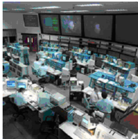
The DSN Network Operations Control Center (NOCC) located within the Space Flight Operations Facility at JPL

JPL has data coming in around the clock, some of it from probes that are traveling through space at a rate of more than 30,000 mph. As a result, all antennas have to be meticulously maintained or non-recoverable data could be lost forever.