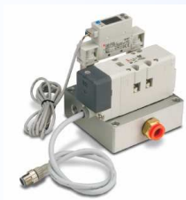
Automatic Leak Detection Detects Leaks Proactively

SMC's Automatic Leakage Detection System enables your machine's control system to not only warn you if a leak developed, but also provides a report that can indicate the total amount of leakage, the number of leaks, and the part of the system actually leaking. These benefits are accomplished with a simple integration between the ALDS and your machines' PLC.