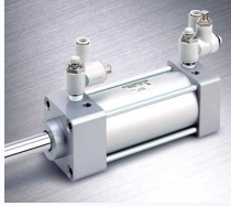
Energy Saving Valve Up to 40% Reduction in Air Consumption

The energy saving valve, SMC series ASR / ASQ, cuts air consumption by operating the non-working actuator stroke at a reduced pressure. The cost savings of this change are significant. In conventional installations the working and non-working stroke operate at the same pressure. Reducing pressure from 100 PSI to 50 PSI on the non-working side of a cylinder can reduce the annual cost of operation.