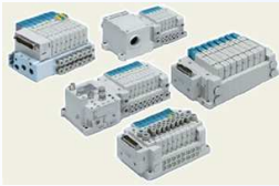
Directional Control Valve 30% Reduction in Wattage

With the SMC directional control valve, series SY, power consumption is reduced to 0.35W (or 0.1 W with an optional energy saving circuit). The reduced energy use is accomplished by reducing the wattage required to hold the valve in an energized state.