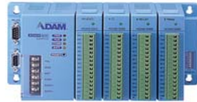
Figure 5: Programmable Automation Controller Uses Embedded Computing

The design should be capable of running Windows' embedded OS. Embedding the operating system frees up storage for data and other essential operations. These embedded operating systems provide all of the features found in the RAM-resident versions, but are provided on flash memory so they boot up immediately on startup and do not require shutdown. These embedded computing devices make excellent notepads for wireless workers, as well as networking appliances, displays, field controllers and PACs.