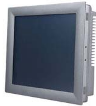
Figure 3: Embedded Computer Used as Touch Panel Display

The increasing ubiquity of industrial Ethernet and USB hardware interconnection have also made the transition from single purpose designed processors to using embedded processors in a variety of guises not only possible but quite easy, and is the third key to the development of ubiquitous embedded computing. The touch panel display shown in Figure 3 is in fact a fully featured PC computer taking advantage of the embedded computer design. This “display” is really a PC designed with the Intel Pentium M 1.4 GHz/Celeron M 1 GHz processor as its core. The Intel Pentium M/Celeron M has low power consumption and 1.4 GHz/1 GHz operating frequency. This system is fanless although the kernel is powerful. This “display” is a fully networked computer, with embedded Ethernet, USB, RS-485, and even audio and video I/O ports.