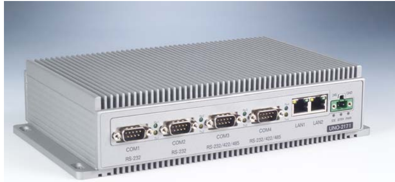
UNO-2171 (Intel® Pentium® M Embedded Automation Computer)

The U. S. Food and Drug Administration (FDA) has mandated a Process Analyzer Technology push, which is taking formerly lab devices and putting them out in the process plant and on the production line. Process Analyzers typically report a high bandwidth data stream rather than the bit or byte data or analog values that simpler field sensors report. Since many of these analyzers are built using COTS embedded computers, it is easy to see a future where Ethernet will be as pervasive on the factory floor as it is in the rest of the enterprise. Adding to this the machine vision applications, RFID sensors, and collaborative engineering software that is being rolled out on the plant floor makes the installation of Gigabit Ethernet on the plant floor mandatory for economic competitiveness in the future. It may even be that wireless Ethernet will also pervade the industrial plant. Sensor design packages have become available with 802.15.4 LoPAN radios embedded on the board, and with IPv6 Ethernet stacks natively installed as firmware on the radios.