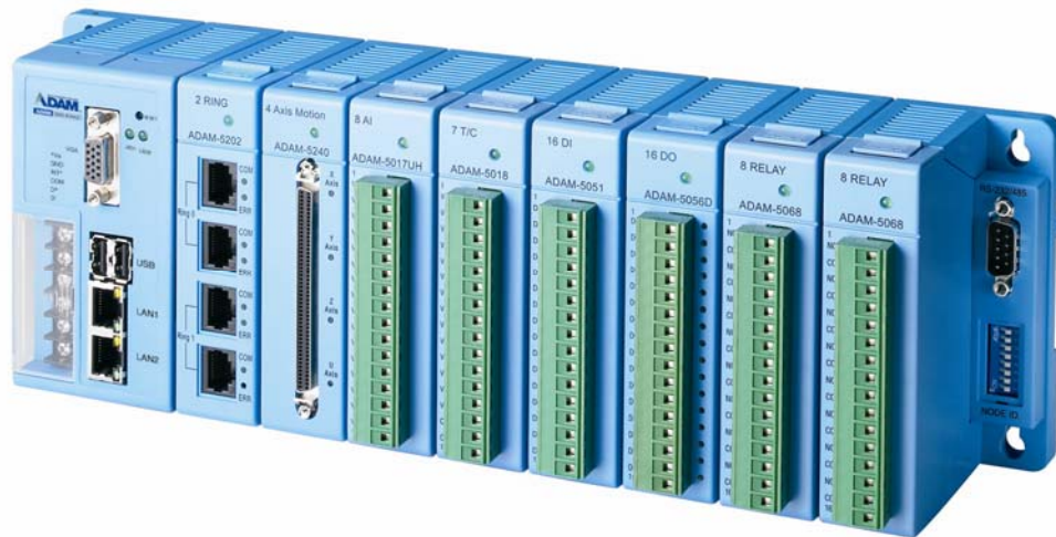
ADAM-5550KW (8 Slot Programmable Automation Computer)

Pressure from customers as long as twenty years ago caused many suppliers to abandon their proprietary network protocols in favor of Ethernet, at least from the controller to the main process control computer. Finally, the growth of embedded computing in industrial applications with the use of programmable automation controllers or PACs with built in Ethernet networking made it a foregone conclusion that Ethernet would be used in the plant floor environment.