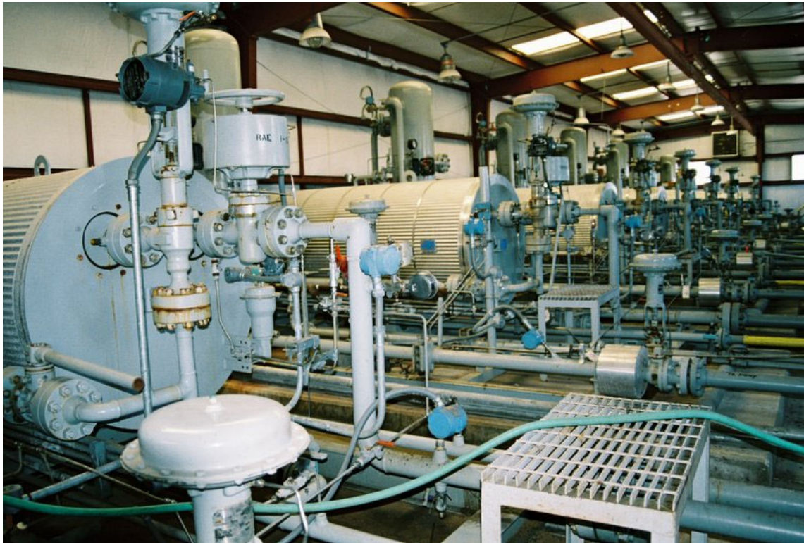
Gas processing plant